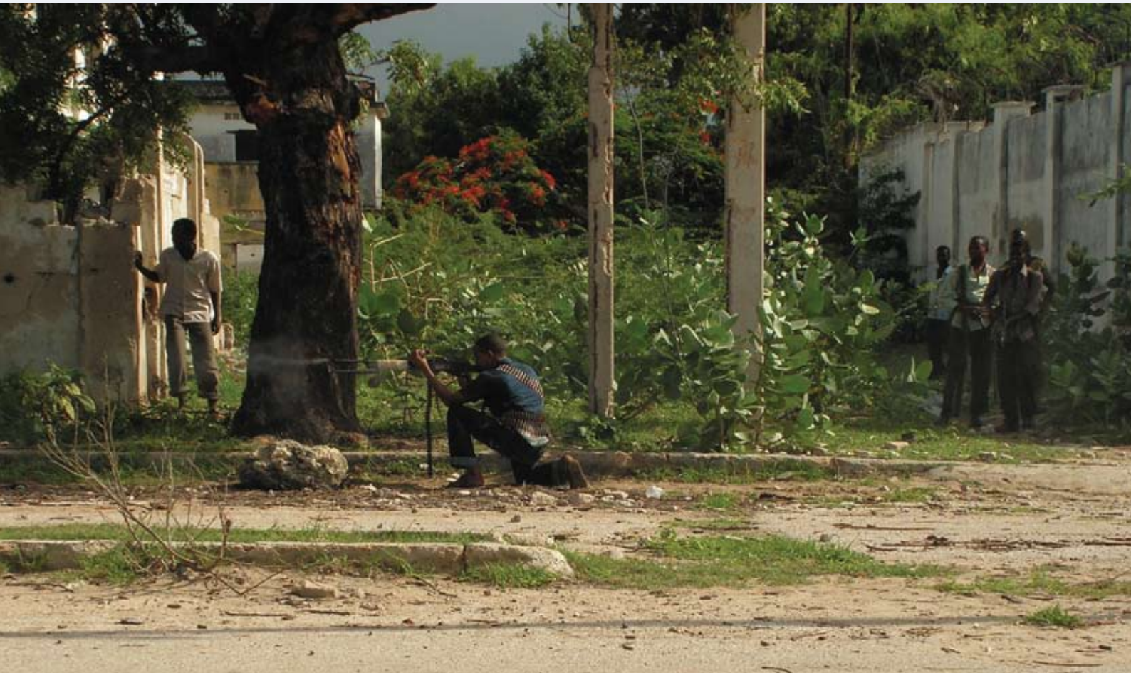
Journalist takes cover behind a wall as fierce fighting captures him in the crossfire.

NUSOJ Annual Press Freedom Report http://www.nusoj.org/2009%20ANNUAL%20REPORT-NUSOJ%2031.12.09.pdf