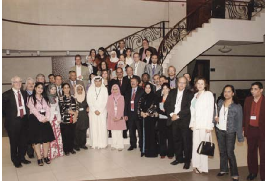
IFJ regional meeting, Amman, October 2009.

In late 2009, the press echoed assertions of bribery involving the Jordan Petroleum Refinery Company (JPRC) and chief national figures. The government opened a criminal investigation, but in March 2010, the Jordanian State Security Court forbade the media reporting on the case without its authorisation.