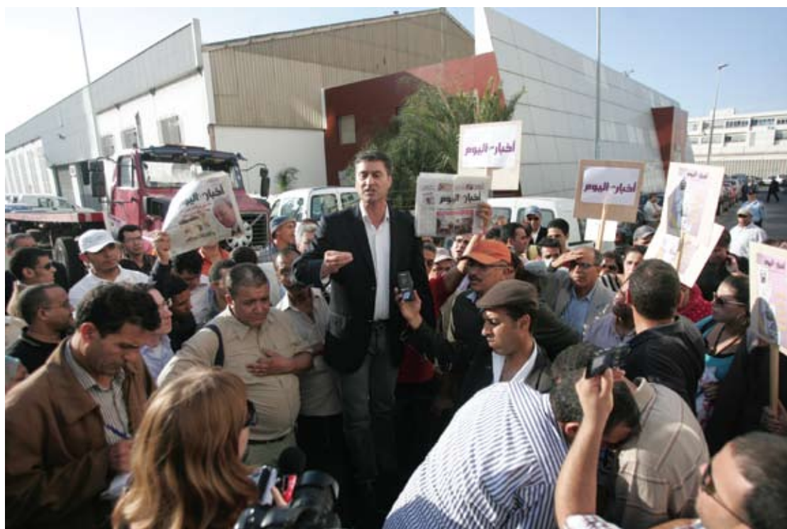
SNPM demonstration on 2 October 2009, at the headquarters of Akhbar El Youm newspaper in Casablanca.